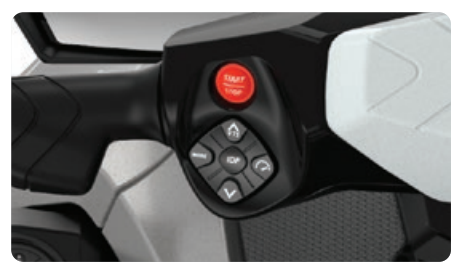
iDF - Intelligent Debris-Free Pump System An innovative, industry-first system that a

An innovative, industry-first system that allows you to free your pump of weeds and debris with intuitive handlebar-activated controls.