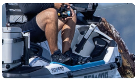
Angled Gunwale Footrests Ensures ergonomic and secure posture while fishing from a side position.

Adds 11.5 inches to the back of the watercraft to increase stability, space, and storage capability.