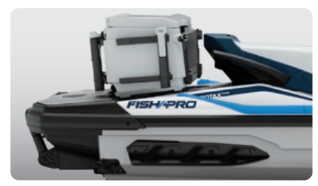
Extended Rear Platform with Second LinQ<sup>®</sup> Attachment System

Adds 11.5 inches to the back of the watercraft to increase stability, space, and storage capability.