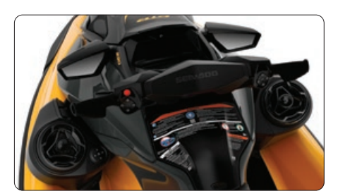
BRP Audio - Premium System (Optional) The industry's first manufacturer-installed truly waterproof Bluetooth<sup>†</sup> audio system.