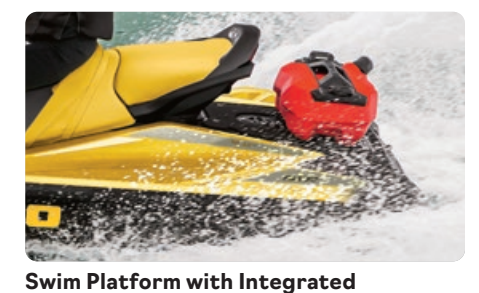
LinQ® System Exclusive quick-attach system on a large swim platform that allows for easy installation of storage accessories.