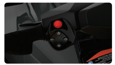
VTS™ (Variable Trim System) Provides handlebar-activated settings so riders can easily find the ideal trim for varying conditions.