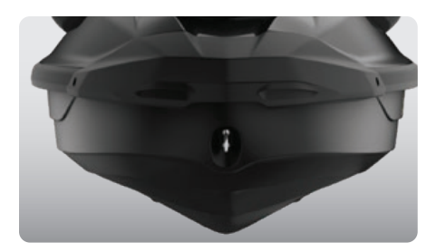
GTI Hull This moderate V-shaped hull guarantees a stable, enjoyable ride in variable water conditions. Confident, predictable handling but incredibly playful when you want it to be.