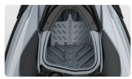
Large Front Storage An impressive 40 gallons of sealed storage space allows riders to safely stow belongings while riding

©2021 Bombardier Recreational Products Inc., (BRP). All rights reserved. ®, TM and the BRP logo are trademarks of Bombardier Recreational Products Inc. or its affiliates. Products are distributed in the USA by BRP US Inc. All product comparisons, industry and market claims refer to new sit-down PWC with 4-stroke engines. Watercraft performance may vary depending on, among other things, general conditions, ambient temperature, and altitude, riding ability and rider/passenger weight. Testing of competitive models done under identical conditions. Because of our ongoing commitment to product quality and innovation, BRP reserves the right at any time to discontinue or change specifications, price, design, features, models or equipment without incurring any obligation. Printed in Canada.