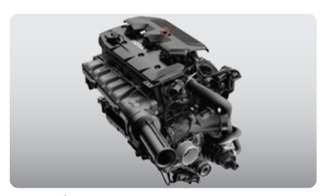
ROTAX® 1630 ACE™ - 230 Engine This powerful engine comes standard with a supercharger and external intercooler. It is optimized to run on regular fuel, which lowers fuel costs.