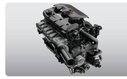
ROTAX® 1630 ACE™ - 300 The Rotax® 1630 ACE - 230 offers instant acceleration by way of a powerful supercharger, while the new Rotax® 1630 ACE™ - 300 is the most powerful Rotax engine ever on a Sea-Doo.