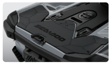
Swim Platform with Integrated LinQ<sup>®</sup> System

An innovative hull that sets the benchmark for rough water handling, stability, and offshore performance.