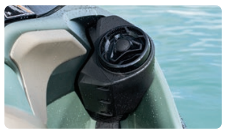
BRP Audio - Premium System The industry's first manufacturer-installed truly waterproof Bluetooth‡ audio system.

An innovative, industry-first system that allows you to free your pump of weeds and debris with intuitive handlebar-activated controls.