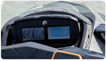
Full-Color 7.8" Wide Display Full-color display with incredible visibility and a new level of functionality. Bluetooth and smartphone app integration provides music, weather, navigation and more.