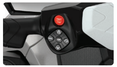
iDF – Intelligent Debris-Free Pump System

An innovative, industry-first system that allows you to free your pump of weeds and debris with intuitive handlebar-activated controls.