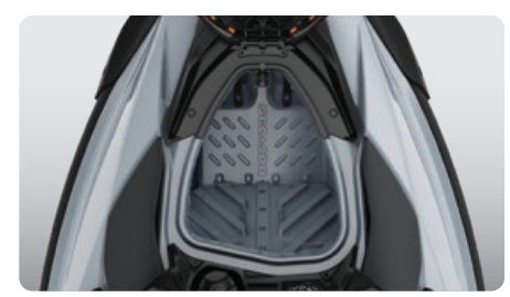
Large Front Storage

This moderate V-shaped hull guarantees a stable, enjoyable ride in variable water conditions. Confident, predictable handling but incredibly playful when you want it to be.