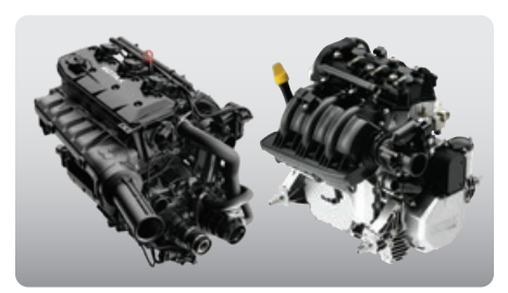
ROTAX® 900 ACE™ - 90/1630 ACE™ - 130

This exclusive Sea-Doo® feature optimizes power output for up to 46% improved fuel efficiency.