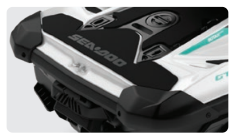
Swim Platform with Integrated LinQ® System

Exclusive to Sea-Doo®, iBR® stops the watercraft sooner and provides more control and maneuverability at low speeds and in reverse.