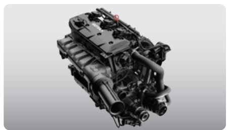
ROTAX® 1630 ACE™ - 170

Provides easy transport of a wakeboard.1