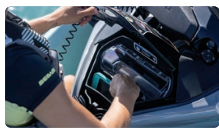
Watertight Phone Compartment

An industry-first manufacturer-installed, truly waterproof, Bluetooth^{\dagger} audio system.