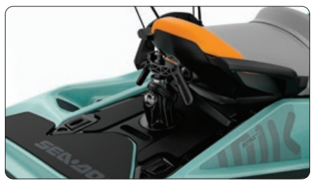
LinQ® Retractable Ski Pylon

Five preset acceleration profiles make it easy to deliver a smooth launch and maintain consistent pace.