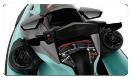
BRP Audio - Premium System (Optional)

The new Rotax® 1630 ACE™ - 170 is the most powerful naturally aspirated Rotax engine ever on a Sea-Doo watercraft.